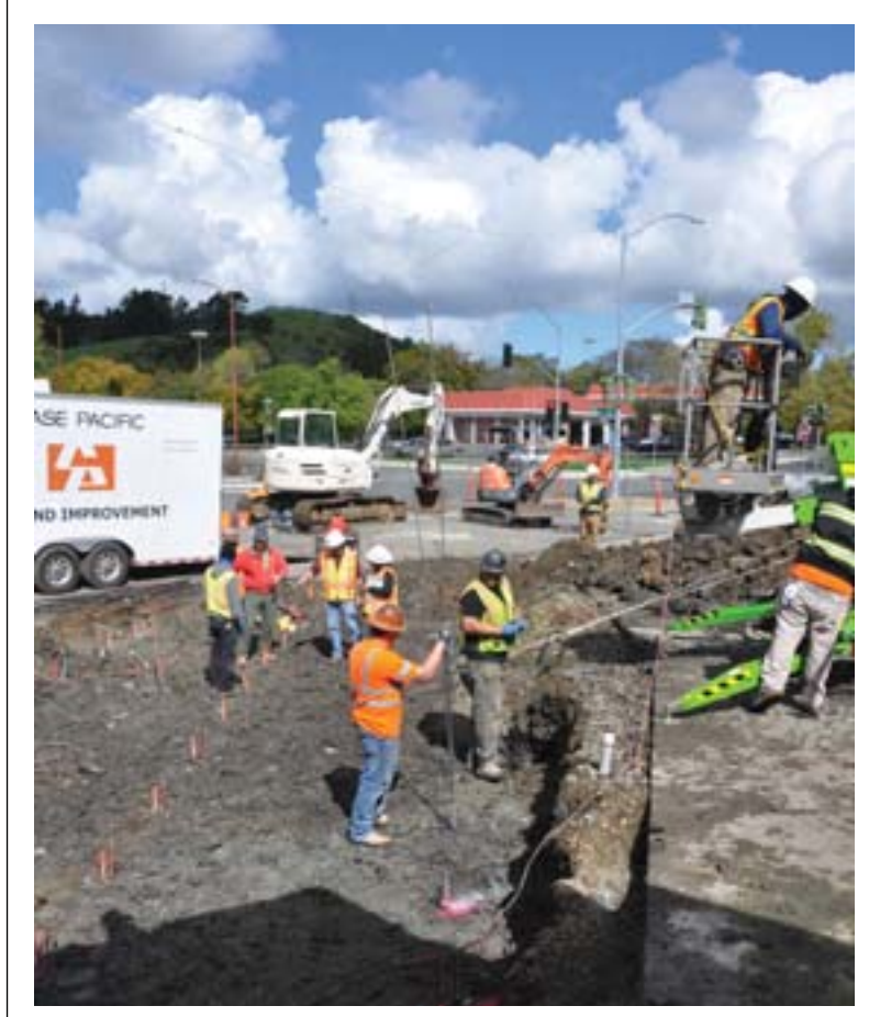
Work on the Moraga sinkhole at the corner of Rheem Boulevard and Center Street is in progress. Cars are allowed to enter but not exit the shopping center from Rheem Boulevard.