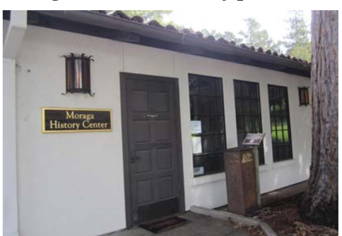
Moraga Historical Society's History Center